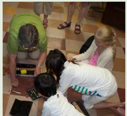
Kids at the Children's Assembly unleashed their creative powers while exercising their muscles creating leather wrist bands. A variety of Wild Hope themes from waves of water to nature scenes came alive as hammers pounded stamp impressions into the bracelets.