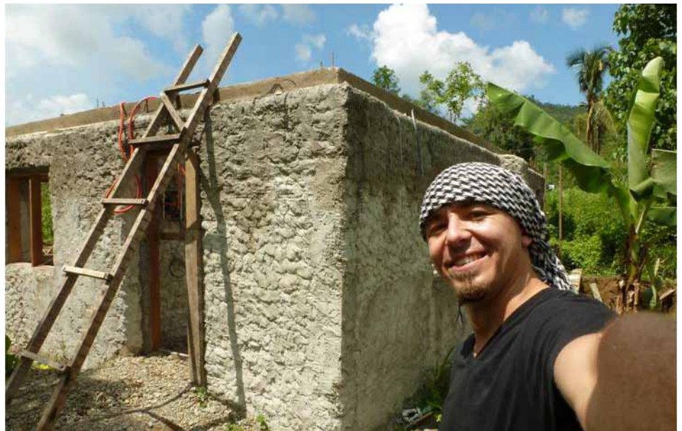
By mid-June, the earthbag home in Babatngon on the island of Leyte has a completely different appearance.

without washing away. And they can be more easily reconstructed or even added to should something unexpected happen.